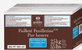
Cacao Barry Paillette Feuilletine 2.5 kg