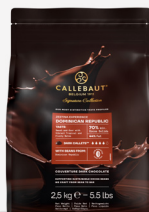
Callebaut Zestina Experience Dominican Republic Dark Chocolate 70% 2.5 kg