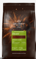
Callebaut Botanical Experience Extra Brute Cocoa Powder 5 kg