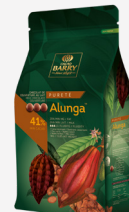
Cacao Barry Alunga Milk Chocolate 41% 5 kg