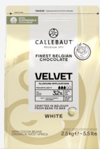
Callebaut Velvet White Chocolate 32% 2.5 kg