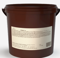
Callebaut Almond Praliné 47% 5 kg