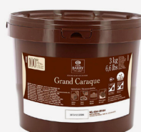
Cacao Barry Cocoa Mass Grand Caraque 3 kg