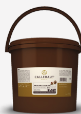
Callebaut Hazelnut Praliné 50% 5 kg