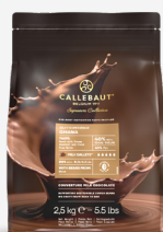
Callebaut Silky Experience Ghana Milk Chocolate 40% 2.5 kg