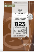
Callebaut 823 Milk Chocolate 33% 2.5 kg