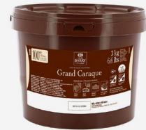
Cacao Barry Cocoa Mass Grand Caraque 3 kg