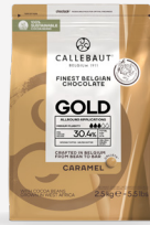
Callebaut Gold Chocolate 30% 2.5 kg