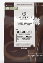
Callebaut 70-30-38 Extra Bitter Dark Chocolate 70% 2.5 kg