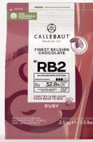
Callebaut Ruby Chocolate 33% 2.5 kg