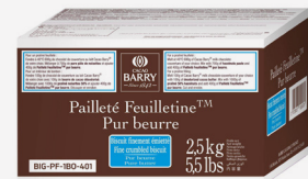
Cacao Barry Paillette Feuilletine 2.5 kg