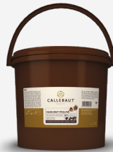
Callebaut Hazelnut Praliné 50% 5 kg