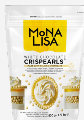
Mona Lisa Crispearls White Chocolate 0.8 kg