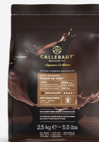
Callebaut Rustic Experience Fleur de Cao Dark Chocolate 70% 2.5 kg