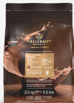
Callebaut Silky Experience Ghana Milk Chocolate 40% 2.5 kg