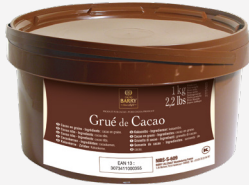
Cacao Barry Cocoa Nibs 1 kg