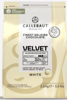
Callebaut Velvet White Chocolate 32% 2.5 kg